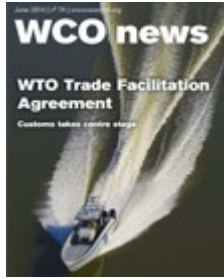
WCO News: WTO Trade Facilitation Agreement