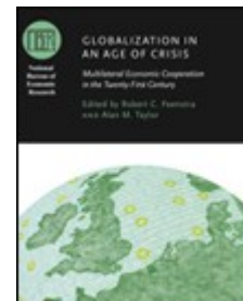
Globalization in an Age of Crisis: Multilateral Economic Cooperation in the 21st Century