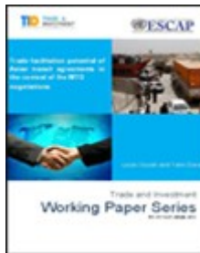
Trade Facilitation Potential of Asian Transit Agreements in the Context of the WTO Negotiations