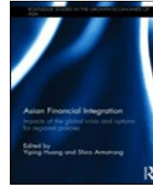
Asian Financial Integration: Impacts of the Global Crisis and Options for Regional Policies