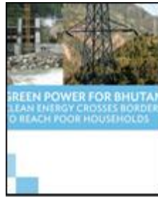
Green Power for Bhutan: Clean Energy Crosses Borders to Reach Poor Households