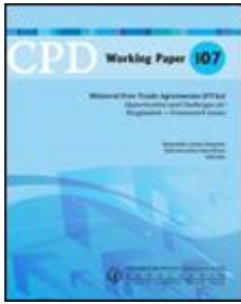
Bilateral Free Trade Agreements (FTAs): Opportunities and Challenges for Bangladesh