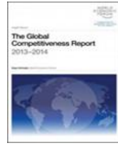
Global Competitiveness Report 2013-2014