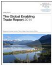
The Global Enabling Trade Report 2014