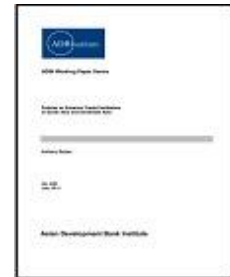
Policies to Enhance Trade Facilitation in South Asia and Southeast Asia

See more publications on regional cooperation in South Asia and other regions at http://www.sasec.asia/publications.php