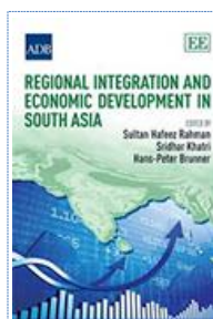
Regional Integration and Economic Development in South Asia 2012