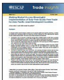
Making Market Access Meaningful