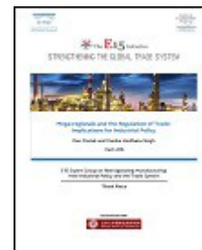
Mega-regionals and the Regulation of Trade