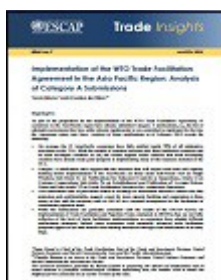
Implementation of the WTO Trade Facilitation Agreement in the Asia-Pacific Region