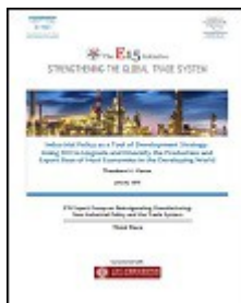
Industrial Policy as a Tool of Development Strategy