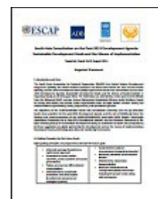
Key Recommendations: South Asia Consultation on the Post-2015 Development Agenda

See more publications on regional cooperation in South Asia and other regions at http://www.sasec.asia/publications.php