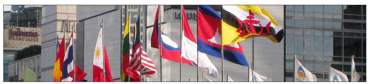
ASEAN Member State flags fly at the 18th ASEAN Summit in Jakarta in 2011.