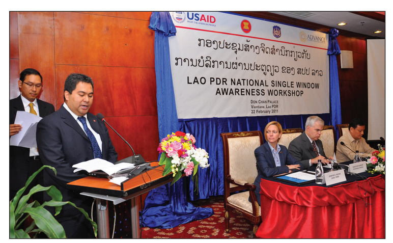
The ASW Project organized the first single window awareness workshop in Lao PDR.