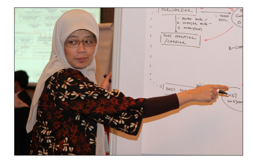
Private sector representative leads a working group discussion on prioritizing trade and customs data to be exchanged among member states through the ASW.