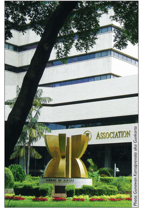
ASEAN symbol of unity at ASEAN Secretariat headquarters in Jakarta.