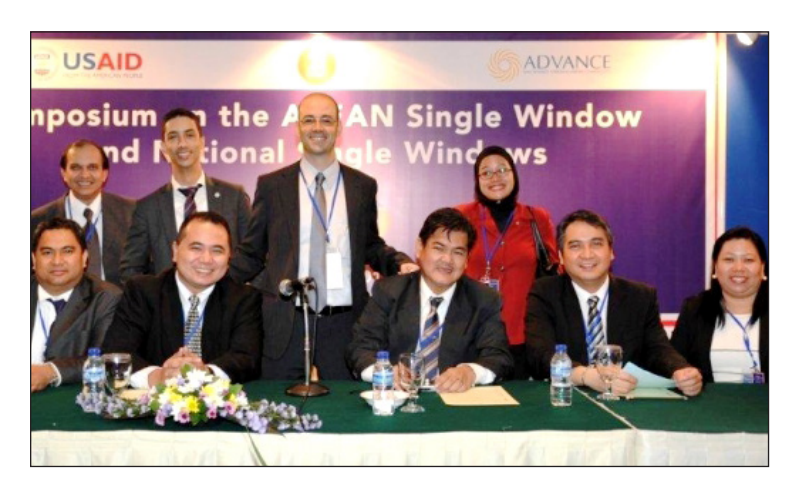
Regional public-private symposium on ASW and NSWs