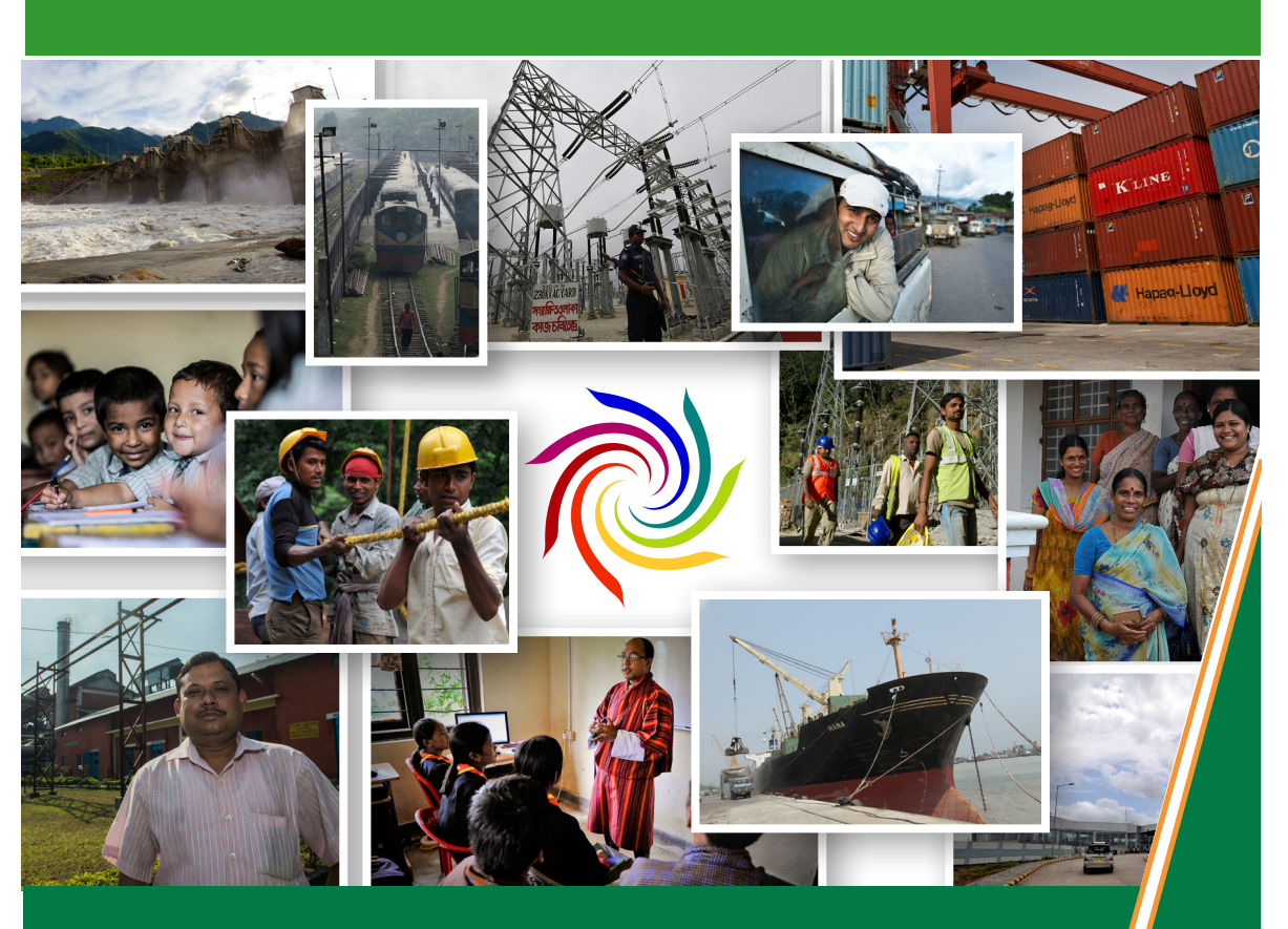
Printed in the Philippines