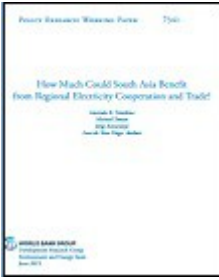
How Much Could South Asia Benefit from Regional Electricity Cooperation and Trade?