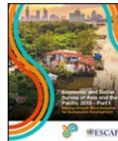
Economic and Social Survey of Asia and the Pacific 2015