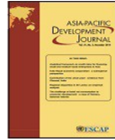
Asia-Pacific Development Journal Vol. 21, No.2, December 2014

See more publications on regional cooperation in South Asia and other regions at http://www.sasec.asia/publications.php