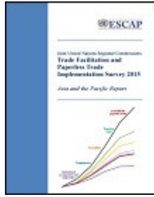
UNRC Trade Facilitation and Paperless Trade Implementation Survey 2015: Asia and the Pacific Report