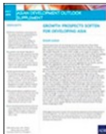
Asian Development Outlook 2015 Supplement