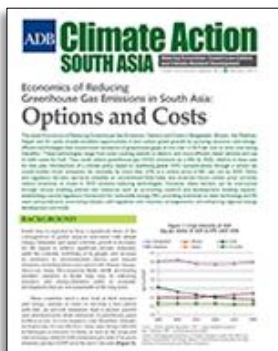
Economics of Reducing Greenhouse Gas Emissions in South Asia: Options and Costs 2013