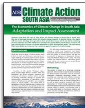
The Economics of Climate Change in South Asia: Adaptation and Impact Assessment 2013