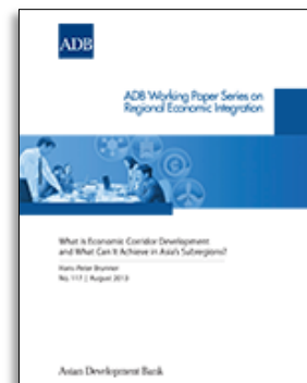
What is Economic Corridor Development and What Can it Achieve in Asia's Subregions? 2013

See more publications on regional cooperation in South Asia and other regions at http://sasec.asia/web/index.php/en/knowledge-products/books