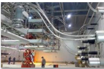
Report & Recommendation of the President