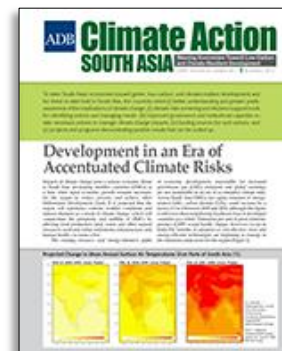
Development in an Era of Accentuated Climate Risks 2012