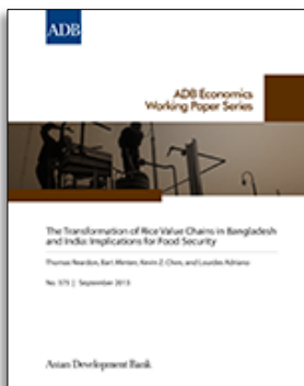
The Transformation of Rice Value Chains in Bangladesh and India: Implications for Food Security 2013