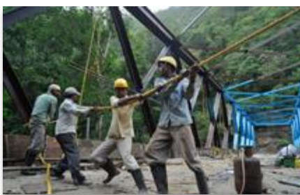
Report & Recommendation of the President Project Completion Report

ADB allocated $100 million in financing for the project in 2010, while the Government of Bangladesh allocated $59 million. ADB will consider an additional $ 12 million of financing at the request of the Government to meet part of the cost over-runs on the project.