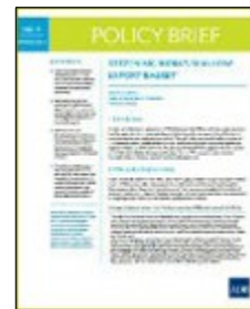
Deepening India's Shallow Export Basket

See more publications on regional cooperation in South Asia and other regions at http://sasec.asia/publications.php