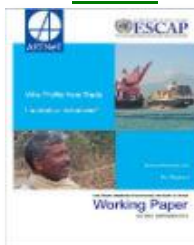
Who Profits from Trade Facilitation Initiatives?