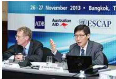
Event Documents and Materials on SASEC Website