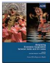
Deepening Economic Cooperation between India and Sri Lanka