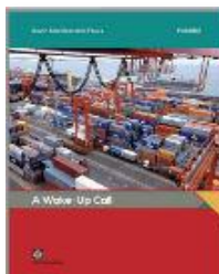
South Asia Economic Focus: A Wake-Up Call