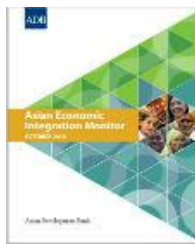
Asian Economic Integration Monitor