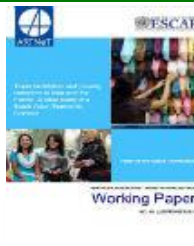
Trade Facilitation and Poverty Reduction in Asia and the Pacific: A Case Study of a South Asian Economic Corridor